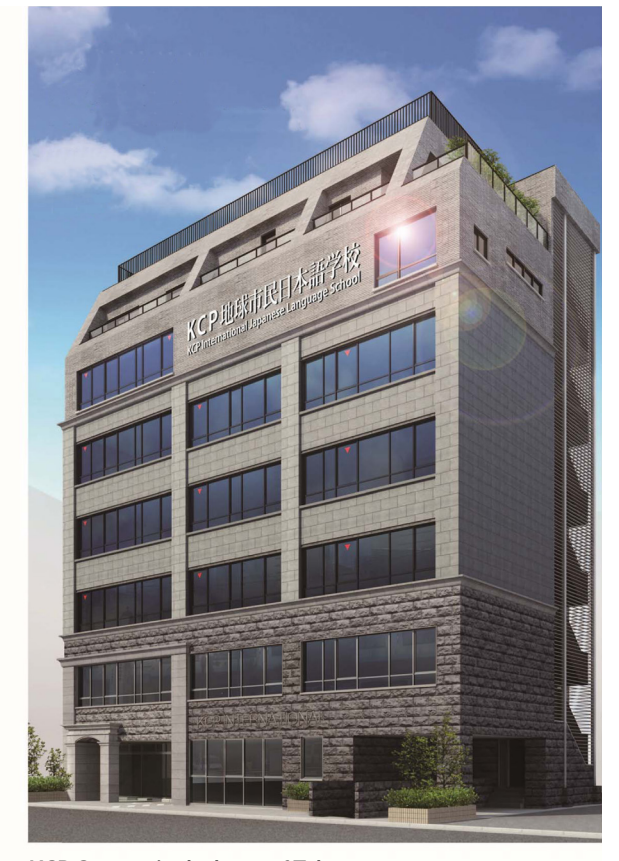
KCP Campus in the heart of Tokyo