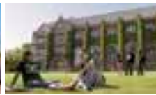
University of Idaho