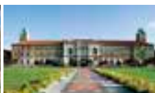
Texas Tech University