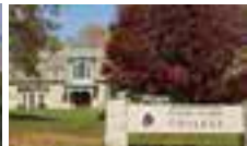
Rhode Island College