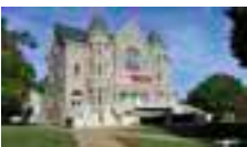
Virginia Union University