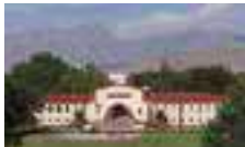
New Mexico State University