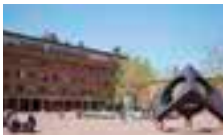
Western Washington University

These universities grant academic credit to students enrolled at them and can also grant transfer academic credit to students from other colleges who apply to the KCP program through them.