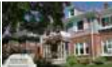
Idaho State University