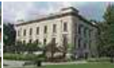
Indiana State University